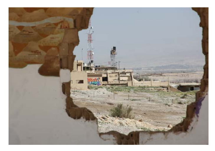
4 – Missile damage, West Bank.