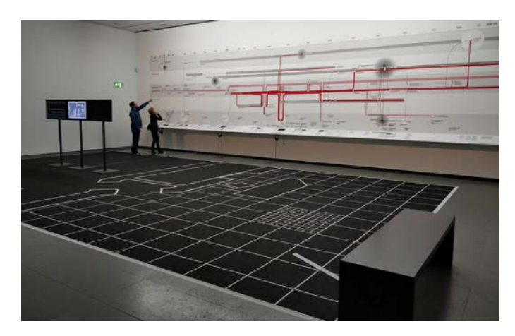
5 – Forensic Architecture, 77sqm_9:26min , reconstruction of the internet café, partial view.

The course of action for reviewing images and records is based on examining and analysing analogue and digital images, which shifts current questions about media practices to a new level of image analysis and aesthetics. Strong public interest in the work of Forensic Architecture, also from an artistic context, proves that fastidious, investigative image analyses about content and aesthetics are increasingly in demand and highly relevant for harbouring open dialogue. The disclosure of examined traces by way of montage engages viewers in the process of excavation. Invited to study the documented information on their own and compare the material and fill in the blanks, viewers are encouraged to make up their own minds. The fact that the iconographically charged images of the viewers themselves act as a kind of mirror, reflecting all the barbaric images of war already ingrained in their memories (such as those by John Heartfield), broadens the exploration of the lines of argument presented in Forensic Architecture's assemblages. Every kind of war, death, atrocity and suffering is already present in us in thousands of powerful images. We carry this "visual proficiency" within us.